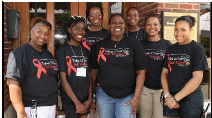
Empowerment Resource Center Staff

Empowerment Resource Center, Inc. 236 Auburn Avenue NE, Suite 200 Atlanta GA 30303 Phone: (404) 526-1145 Fax: (404) 526-1146 www.EmpowerYoungWomen.org