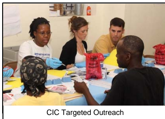
CIC Targeted Outreach