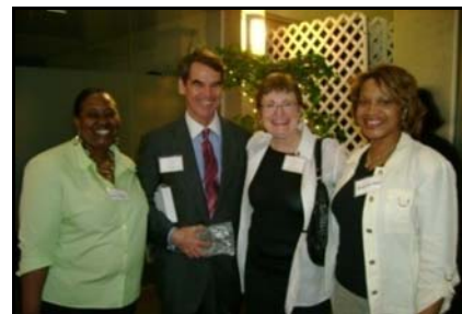
ERC Receives 2010 Fitzgerald Foundation Grant