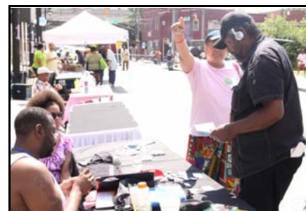
Hope Clinic Booth