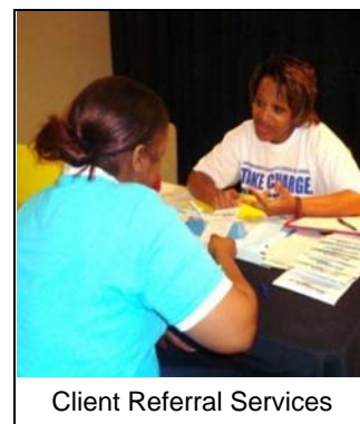
Client Referral Services