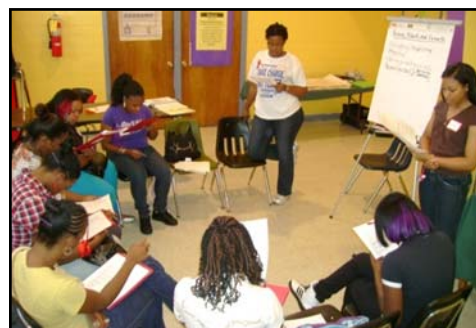
SIHLE Workshop in DeKalb County