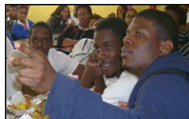
Workshop Targeting Young Men