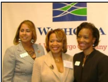
ERC Receives 2009 Wachovia Foundation Grant

ERC will continue to seek funding through grant writing, solicitation from corporate sponsors, and volunteer staff. ERC has forged alliances and agreements with collaborators and community partners to supplement program and service offerings. We currently have the support of several companies and key Georgia legislators. ERC has a strong, fiscally responsible Board of Directors that provides financial support on an as needed basis. Furthermore, ERC has 60 active volunteers. Finally, We are frugal with our financial resources, as 95% of furniture and equipment purchases are made at a fraction of the cost through the Georgia DOAS Surplus Property division.