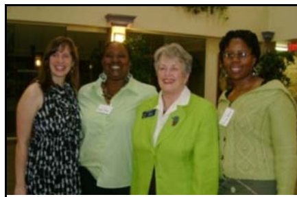
ERC Attends Gala with GA State Sen. Nan Orrock