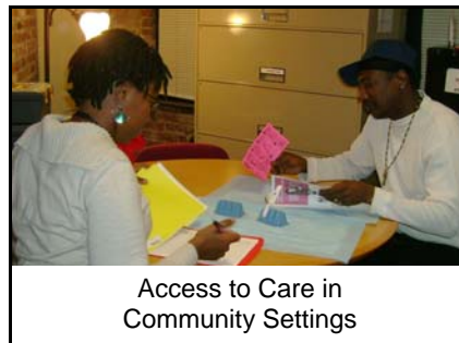
Access to Care in Community Settings