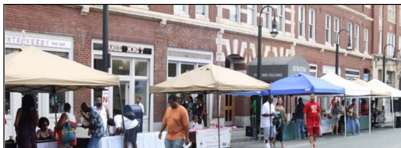
2010 Take Charge. Get Tested. Event (June 25th)

Take Charge. Get Tested.™ Event. In observance of National HIV Testing Day (June 27 th ), ERC hosts its annual Take Charge. Get Tested.™ Event, a day-long campaign which offers free HIV counseling, testing, and prevention-related services targeted to hard-to-reach, high risk individuals at high risk of HIV infection. Traditionally, this event is an outside health fair on Auburn Avenue, between Bell Street and Piedmont Road, from 9:00 am to 7:00 pm.