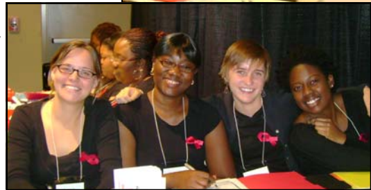
Our Volunteers Fuel Our Passion